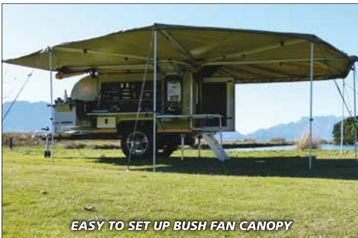
EASY TO SET UP BUSH FAN CANOPY