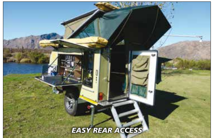
EASY REAR ACCESS