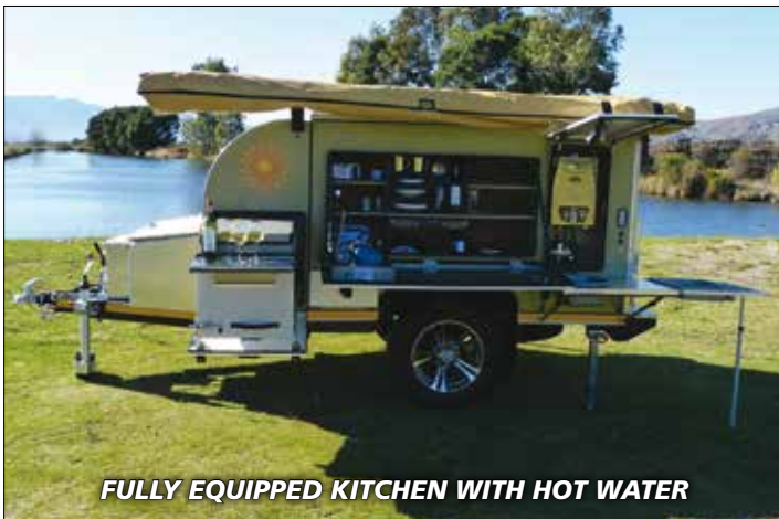
FULLY EQUIPPED KITCHEN WITH HOT WATER