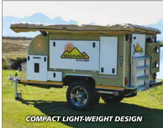
COMPACT LIGHT-WEIGHT DESIGN