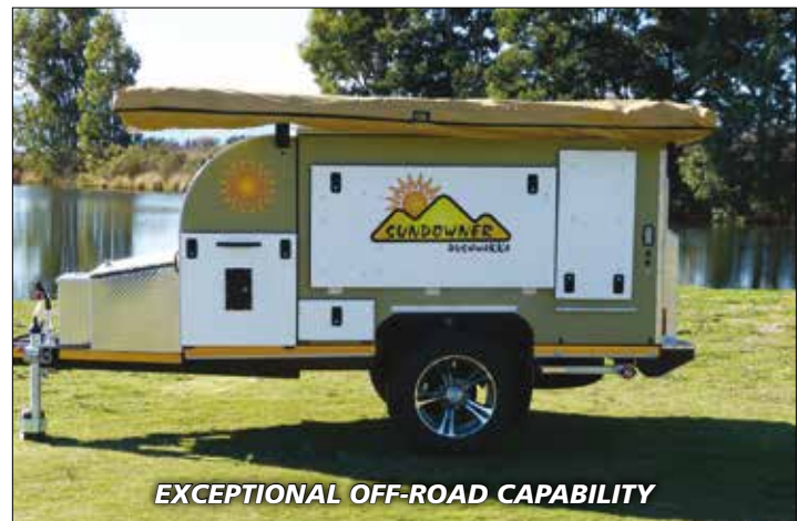
EXCEPTIONAL OFF-ROAD CAPABILITY

13 KRONE STREET • PO BOX 349, WORCESTER 6849 • SOUTH AFRICA Tel: +27 (0)23 342 3438 • Cell: +27 (0)82 773 7544 • Fax: +27 (0)23 342 8469 E-mail: sales@bushwakka.co.za • www.bushwakka.co.za www.youtube/4x4campingtrailer